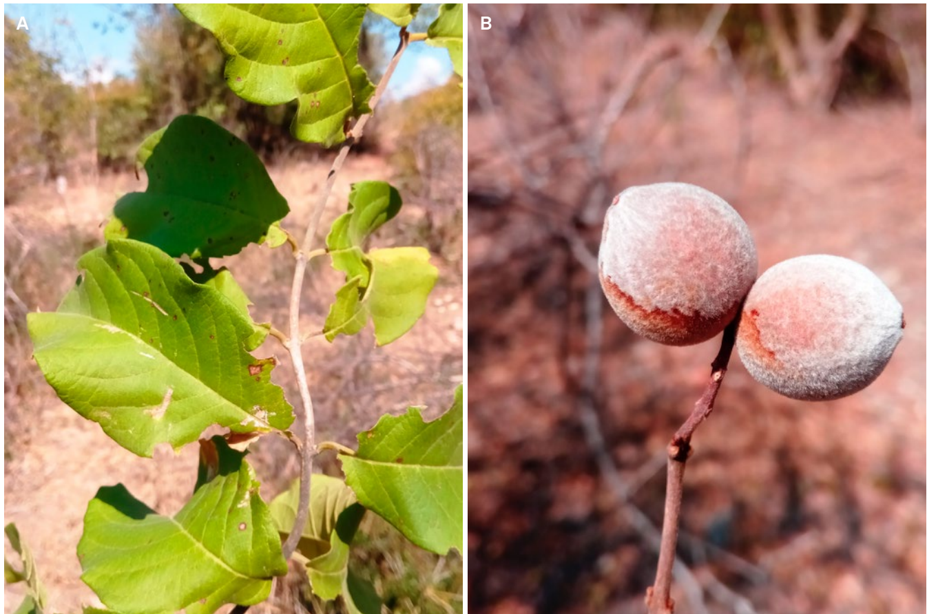
Fig. 3. – Combretum sakoense Jongkind & Callm.: A. Leaves; B. Fruits.

[Rakotoarisoa & Mamy SNGF 4060, K, TAN, TEF; https://www.inaturalist.org/observations/12949066 ]